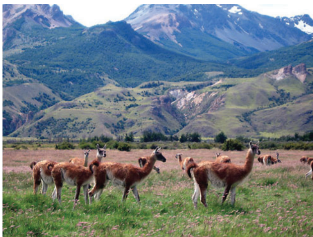
Fig. 3. Valley of 5 km width containing guanaco ( Lama guanicoe ), a species which coexists with huemul adjacent to this area and elsewhere.

To further support implied genetic isolation, a very limited dispersal capacity of adult huemul was asserted. Citing Gill et al. (2008), a single case of dispersal of 8 km by a subadult female was used to support that the study population cannot receive dispersers from populations 10 km away, thus resulting in an absence of gene flow (Corti et al. 2011). However, given the low density, very small groups and short-term study (Gill et al. 2008), this single dispersal recording most likely does not represent the maximum distance nor the norm for huemul. In fact, a second case of dispersal was recently documented for a marked male that dispersed 15.5 km (Uribe 2011). This too unlikely represents a maximum. Huemul certainly disperse effectively considering their rapid postglacial occupancy of a huge region of South America (30–55°S). White-tailed deer disperse 50 km on average in some areas (but may exceed 200 km, Brinkman et al. 2005); small roe deer disperse 120 and 51 km on average in northern Sweden and interior Norway, respectively; and Alces alces disperse a minimum of 20 and up to 150–200 km (reviewed in Hjeljord 2001).