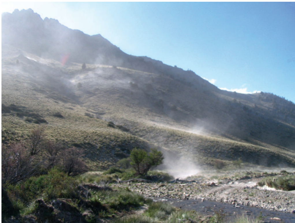
Fig. 3. Ecotonal landscape in the Patagonian study area. Although known for commonly strong eolic conditions, this was a ‘calm’ day without westerlies: this turbulence is due to daily thermal wind patterns, which shift ashes in any direction.

The period of wool growth in sheep ends in late winter (August–September) in the area affected by the PCCVE, which occurred on 4 June 2011. The next shearing thus took place 3–4 months after this tephra fallout, yet fluoride was discarded as a cause for the observed reduction in wool production (Easdale et al. 2014), although overt fluorosis in that region had been described in wild and domestic herbivores including sheep (Flueck and Smith-Flueck 2013a, 2013b; Flueck 2013, 2014). The rapid accumulation of F in herbivores exposed to tephra