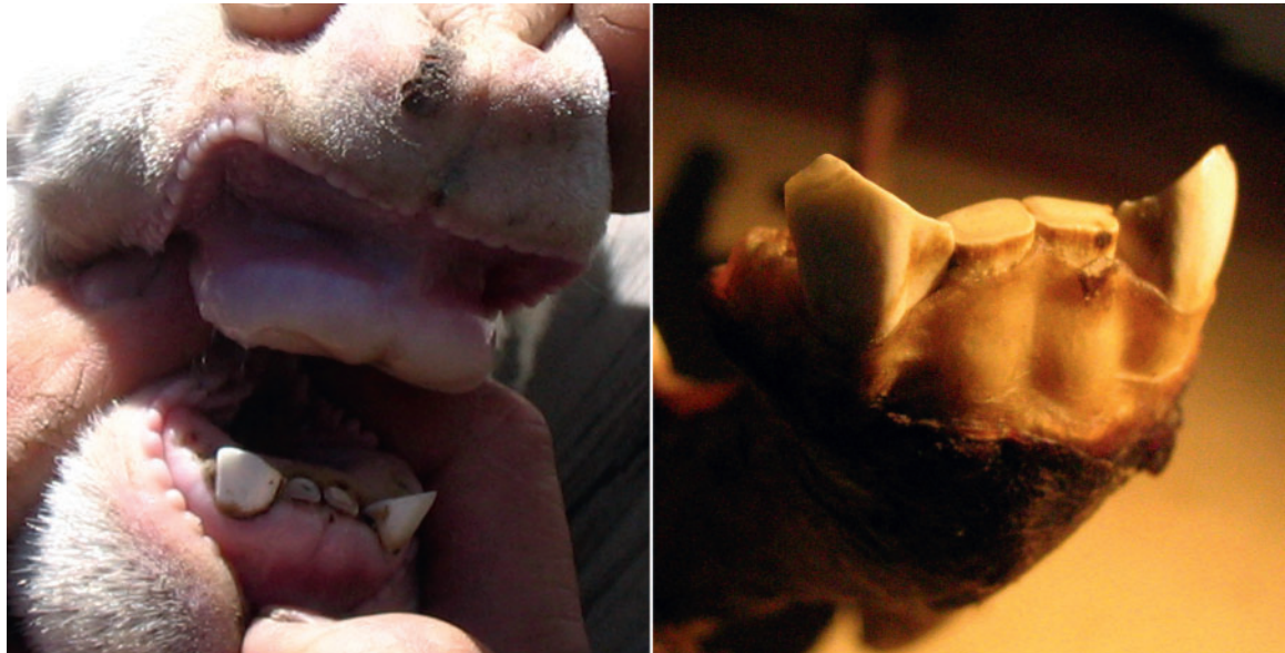
Fig. 2. Typical lesions caused by fluorosis from the Puyehue-Cordon Caulle volcanic eruption event in livestock. The new I1 are already completely worn down as the I2 emerge.