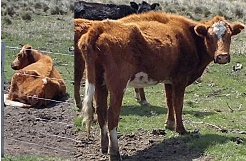
Fig. 5. Numerous periparturient cattle died in early spring even though the winter of 2015 had been very mild. This cow could barely stand up and make a few steps.

in the future and it will be difficult to distinguish from the continuing and overlapping effects from the PCCVE event. For instance, some ranches have experienced major losses of periparturient cattle (in October 2015) even though the winter had been very mild (Fig. 5) and this is most likely caused by the PCCVE rather than the exposure of a few months to CVE tephra. These dead animals had a mean fluoride level in bone of 2159 ppm (max. 4517 ppm, SE 418.8 ppm, n = 11 , W. T. Flueck, unpubl.)