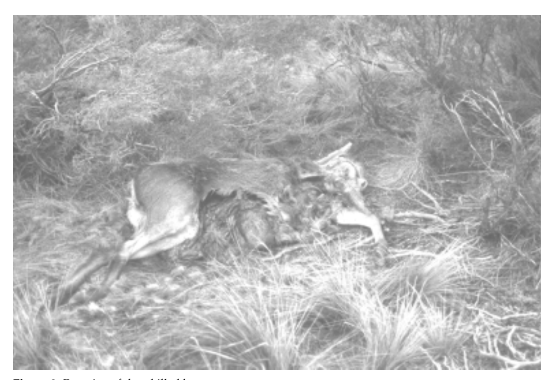
Figure 2 . Remains of deer killed by puma Figura 2 . Restos de ciervo depredado por puma

The radios that were not relocated may have broken, though it is also possible that animals wearing them might have dispersed. Topographic features of the study area may have masked a signal even when the animal had not moved a great distance. Although several aerial censuses had been conducted in attempts