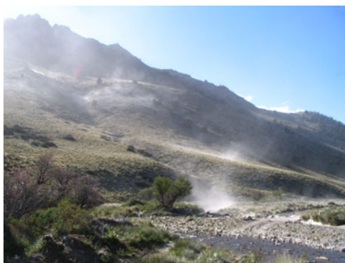
Fig. 2 Ecotonal landscape in Patagonia (study area). Although known for commonly strong eolic conditions, this was a ‘calm’ day without westerlies: this turbulence is due to daily thermal wind patterns that shift ashes in any direction

Evidence for at least a partial barrier to fluoride transfer in utero as well as during lactation has been mentioned regarding ungulates (Cronin et al. 2000; Kierdorf et al. 1996a; Richter et al. 2011). Although it has been proposed that fluoride passes transplacentally in cattle based on a single fetus (Krook and Maylin 1979), Shupe et al. (1992) found